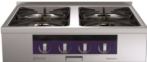
588051 (MAGGABHOPI) 4-Burner gas Top, ecoflam, one-side operated with backsplash